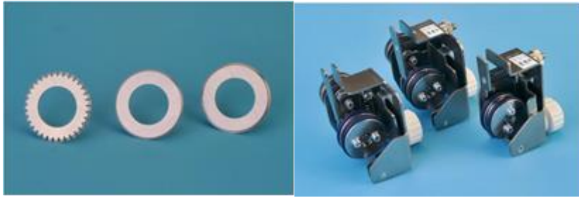
Optional blades for perforation head